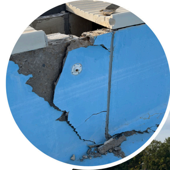
Current damage (add copy)